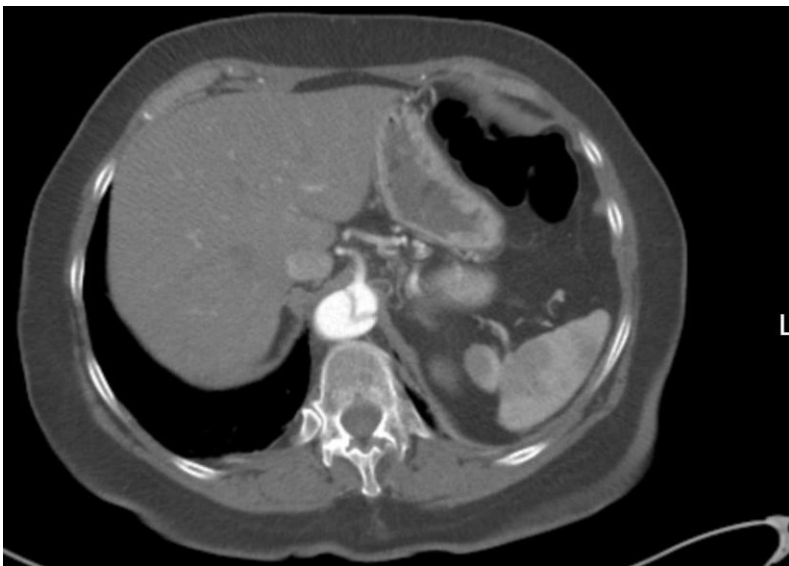
Post contrast CT Aorta showing descending thoracic aortic dissection